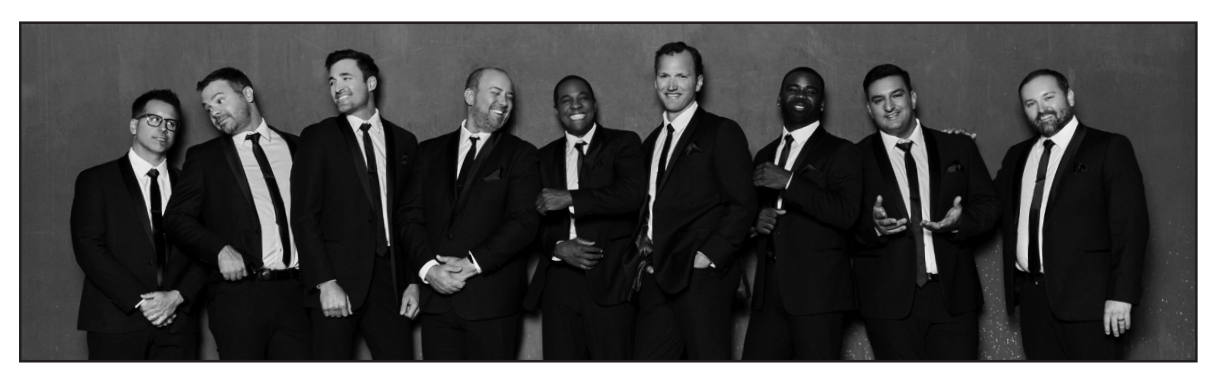
A cappella sensation Straight No Chaser performs at the CCPA on Friday, December 29.

The Cerritos Center for the Performing Arts rings in the holidays with a diverse lineup for December that includes a range of acts, from a cappella to Funk and Hip Hop to timeless holidays classics.